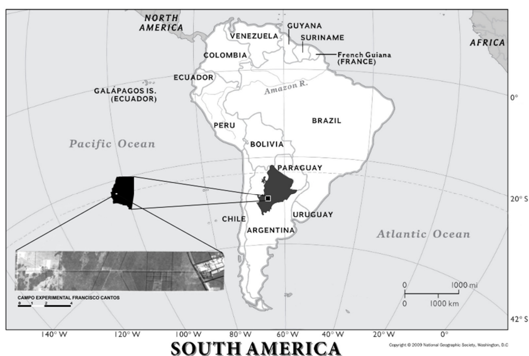
Figure 1. Localization of study area in the western Argentine Chaco region with the satellite image of the Experimental Ranch Francisco Cantos, Instituto Nacional de Tecnología Agropecuaria, Santiago del Estero (INTA).

The study area is located in the western Argentine Chaco region. This region is included in the named semiarid diagonal from South America, with the Cerrado and Caatinga from Brazil (Figure 1). The Argentine Chaco region shows a decreasing precipitation gradient from east to west and the western Chaco region is characterized by a seasonal semiarid climate [27]. Mosaics of grasslands, savannas, and forests with different structures and species compositions [20] represent the native vegetation. The study was carried out in the Experimental Ranch Francisco Cantos (28°01'57" S, 64°15'41" W), belonging to the Instituto Nacional de Tecnología Agropecuaria (INTA), in the province of Santiago del Estero, Argentina (Figure 1). This experimental ranch has 8000 ha with logged forests, silvopastoral systems, a forest reserve area, and grazed grasslands and savannas.